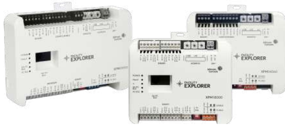
Figure 1: F4-XPM series expansion modules

The F4-XPM series input/output (I/O) expansion modules are part of the Facility Explorer system CG, CV Equipment Controller family and can serve in one of two capacities depending on where they are installed in the Facility Explorer system. When installed on the Sensor/Actuator (SA) Bus of a Facility Explorer controller, an XPM expands the input and output interfaces that can be used with that equipment controller. When installed on the Field Controller (FC) Bus of a Facility Explorer supervisory controller, an XPM can be used as I/O point multiplexors to support monitoring and control from a Facility Explorer supervisory controller. The point multiplexor can also be useful for sharing points between other equipment controllers on the FC Bus using peer-to-peer connectivity.