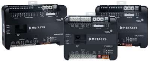
Figure 1: XPM series expansion modules

The M4-XPM series input/output (I/O) expansion modules are part of the Metasys system CG, CV Equipment Controller family and can serve in one of two capacities depending on where they are installed in the Metasys system. When installed on the Sensor/Actuator (SA) Bus of a Metasys controller, an XPM expands the input and output interfaces that can be used with that equipment controller. When installed on the Field Controller (FC) Bus of a Metasys network engine, an XPM can be used as I/O point multiplexors to support monitoring and control from a Metasys network engine. The point multiplexor can also be useful for sharing points between other equipment controllers on the FC Bus using peer-to-peer connectivity.