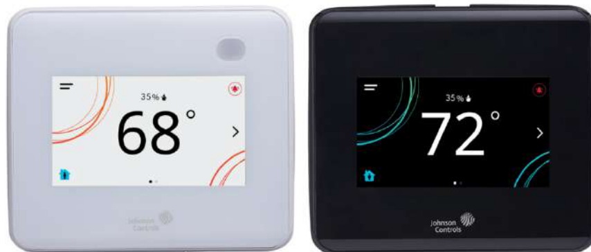
Figure 1: TEC3000 Color Series Thermostat with and without occupancy sensor in white and black enclosures

To provide efficient space temperature control, you can monitor and program the wireless and field-selectable BACnet MS/TP or N2 networked thermostats remotely through the building automation system. The wireless thermostats feature a connection to the ZFR Pro Series Wireless Field Bus Systems. All models include a USB port configuration, with which you can perform simple backup and restore actions from a USB drive. This feature reduces installation time and facilitates rapid cloning of configurations between like units. The programming memory of all TEC3000 Series Thermostats is non-volatile.